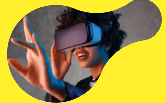
VR/AR and Drones