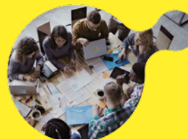
Workspace 4.0 & Collaboration