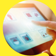
5G and IoT

At CEBIT, you will find all the relevant topics: